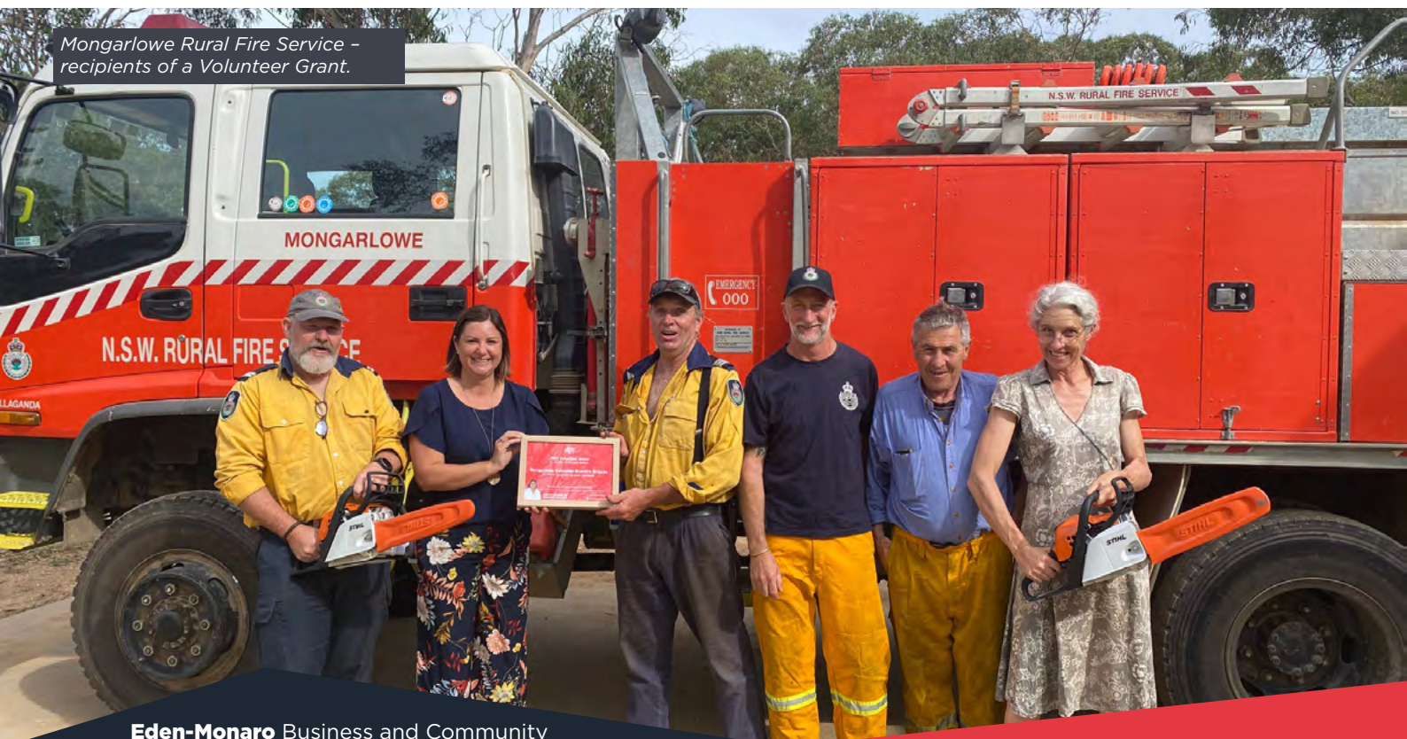
Mongarlowe Rural Fire Service – recipients of a Volunteer Grant.