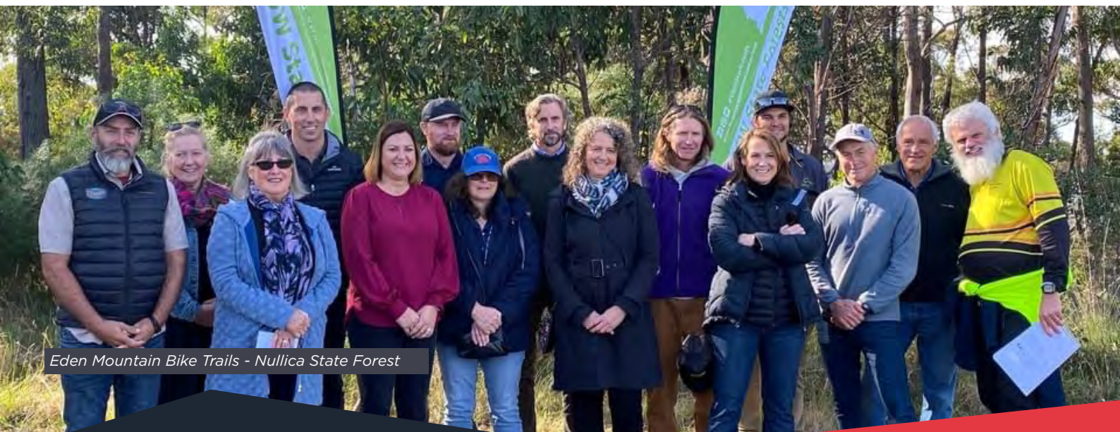
Eden Mountain Bike Trails - Nullica State Forest

① www.wires.org.au/national-grant-program