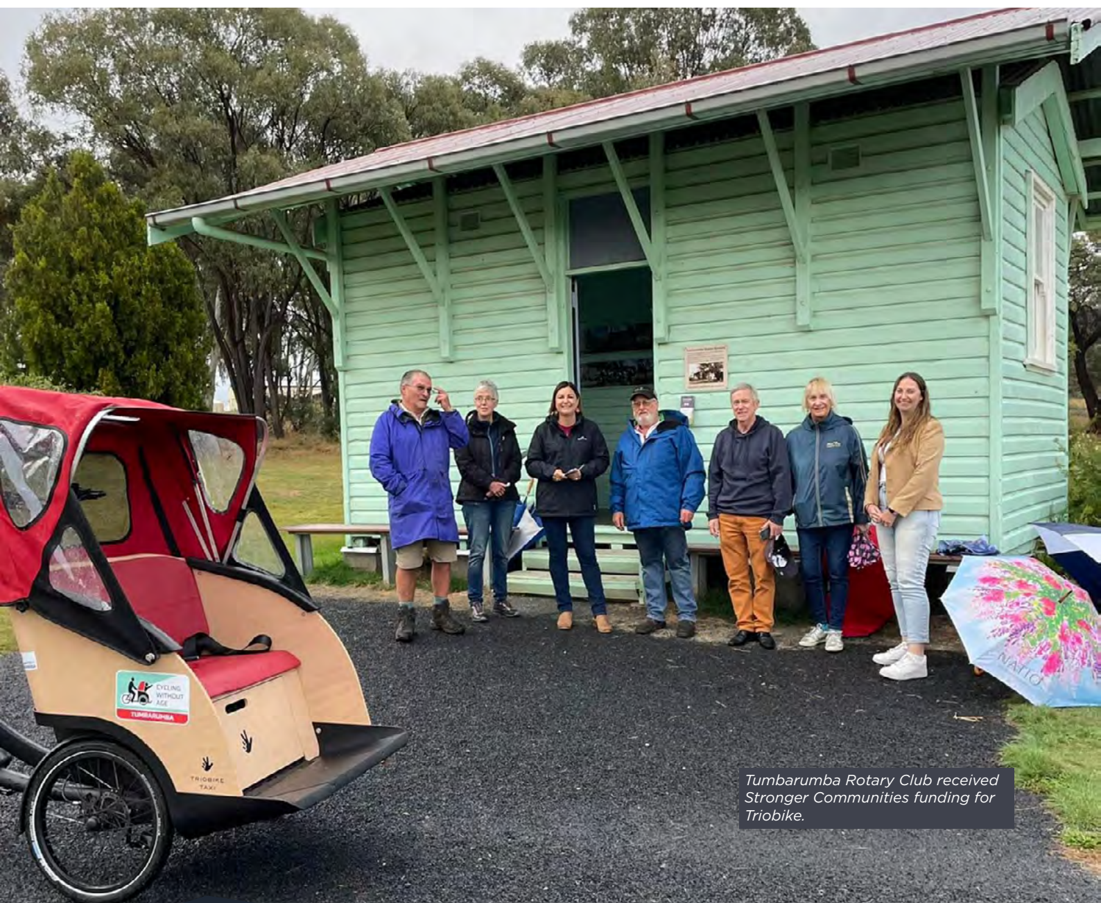
Tumbarumba Rotary Club received Stronger Communities funding for Triobike.

① https://strokefoundation.org.au/what-we-do/research/research-grants/current