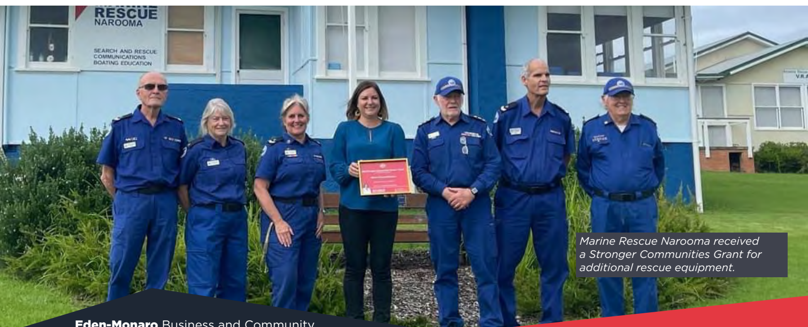
Marine Rescue Narooma received a Stronger Communities Grant for additional rescue equipment.

① www.defence.gov.au/programs-initiatives/strategic-policy-grants-program