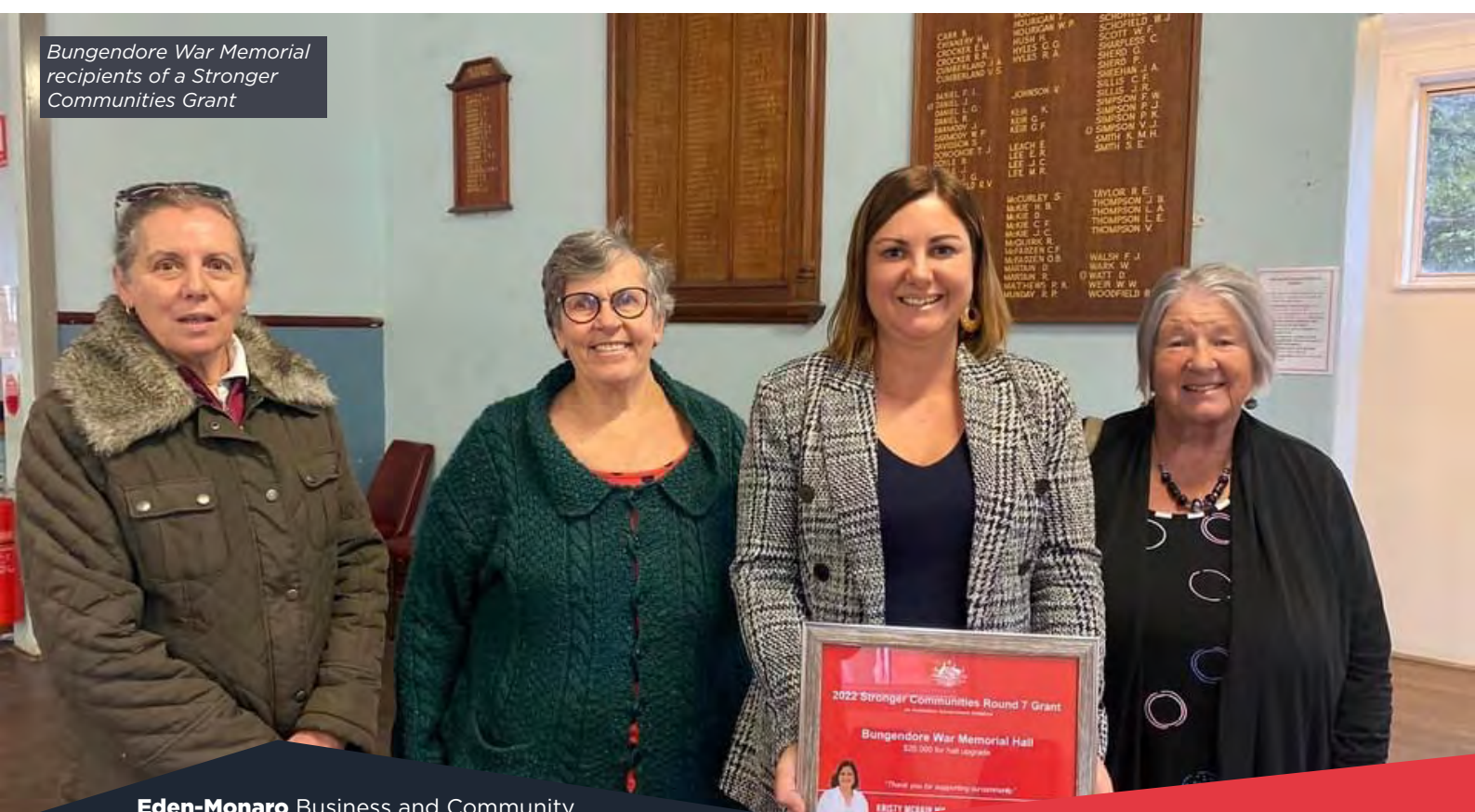
Bungendore War Memorial recipients of a Stronger Communities Grant